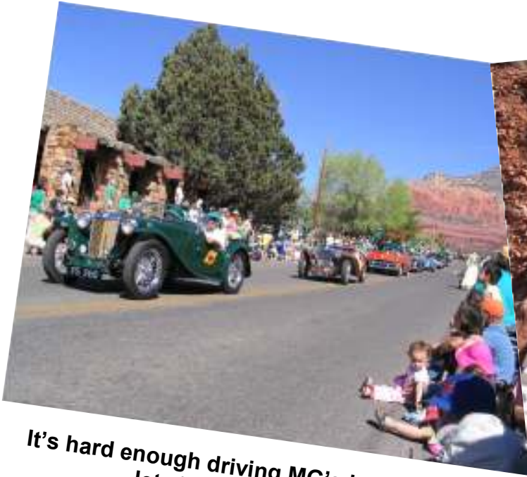
It's hard enough driving MG's in a parade, let alone uphill !!