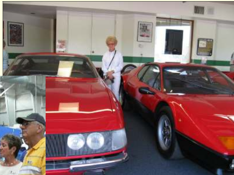
"A ROSE BETWEEN TWO....."

Do ya think he knows there's a great big spider up on the wall behind him?