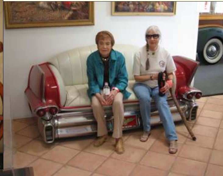
LET'S SEE, A PAIR OF FINS, A PAIR OF TAILLIGHTS, A PAIR OF EXHAUST PIPES, AND A PAIR OF ..... DIVAS ???

Do ya think he knows there's a great big spider up on the wall behind him?