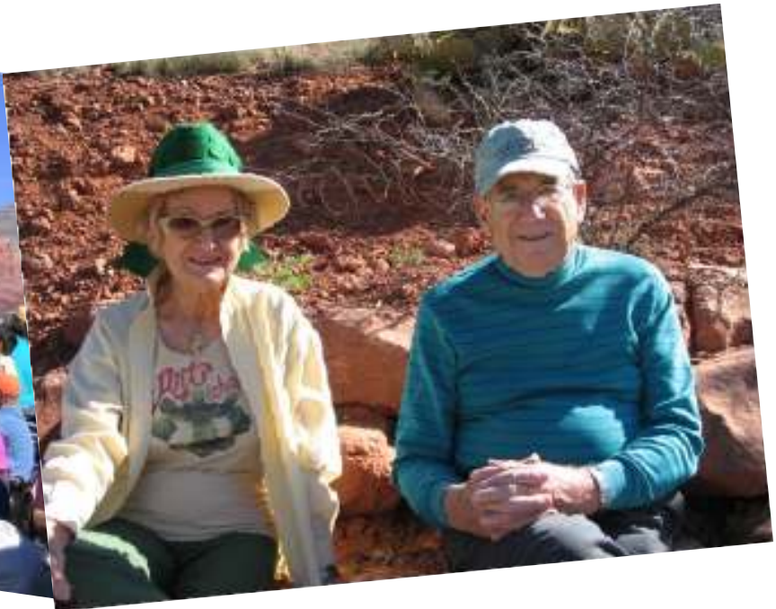
Which one is the Leprechaun ?

No, you don't understand, it's either the frog or the MG, not both.