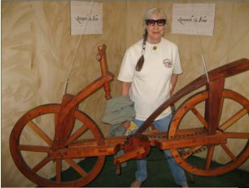
I know I used this contraption once before to spin some yarn, now if I could just remember.