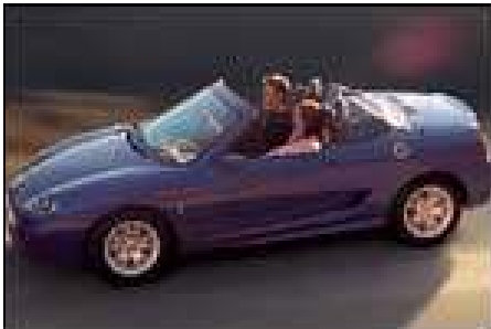
2006 MG TF 135

the right price, but convince buyers its car is real MG. Assembling an existing MG roadster design in England (traditionally coupes are a small portion of MG sports car sales) and development work from Lotus helps credibility.