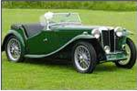
1948 MG Tc

The first Chinese auto plant in the U.S. will not build economy subcompacts, as some might guess, but a revived British sports car. Nanjing Automotive Group of China announced that it intends to build a plant in Ardmore, Oklahoma where it will assemble MGs from Chinese-built components. A research and development center will also be in Oklahoma, and the state will provide a large portion of MG's $2 billion budget. Nanjing bought MG Rover after its collapse in 2005. At that time, MG was building the TF--a 4-cylinder, mid-engine sports car that was Britain's best selling roadster. It was never exported to the U.S. Before MG Rover's collapse, a coupe version was being developed. Current plans are for coupes to be assembled in Oklahoma, and roadsters assembled at the former MG Rover plant in Longbridge, England.