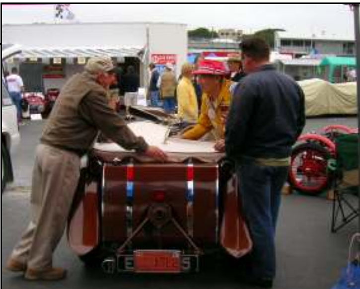
"Excuse me, but would you mind not leaning on the merchandise."