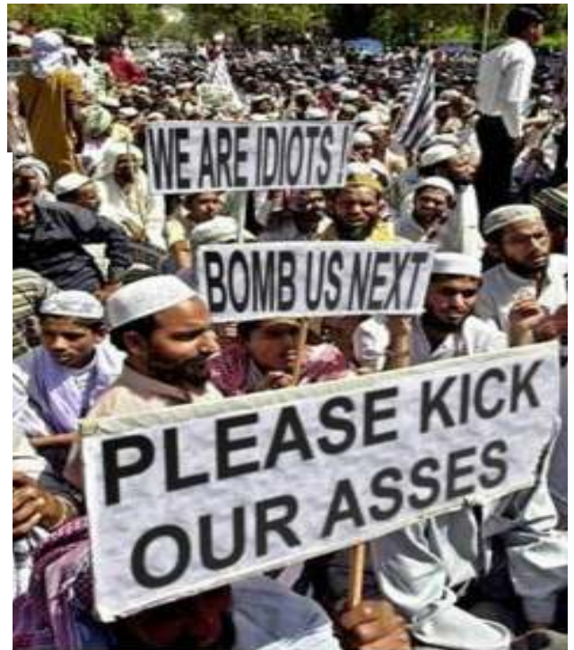
Bus fair to anti-war protest rally - $0.50. Paint and canvas protest signs - $32.00. Asking a retired US Army Sergeant to translate your anti-American slogans - PRICELESS.