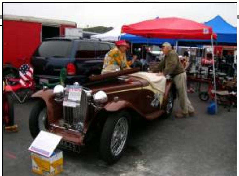
"Ok, this is the last friggin' time I'm gonna ask you to... please step away from the historic, restored, vintage, classic vehicle!"