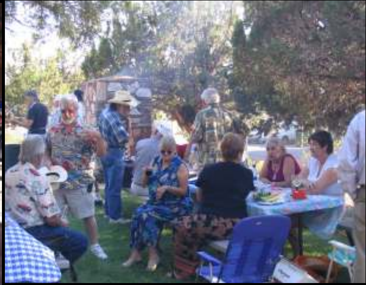
Have you ever seen both Tulleys holding ‘court’ at the same time?