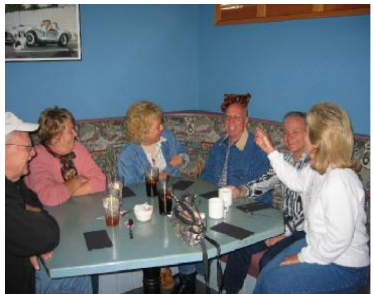
And what garage sale category is that sitting on top of his head?