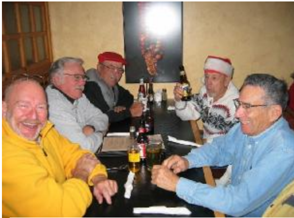
Characters, Comedy & a "Cool One" ...or...two!