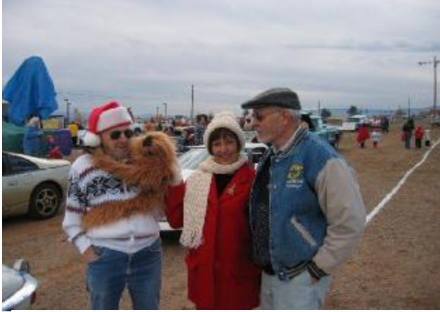
Santa's helpers...both furry and non-furry...I think?

It seems that when you are IN the parade, it's a little tough to take pictures OF the parade. So we took what we could.