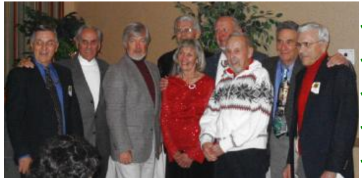
Mount Rushmore doesn't have anything on the Past Presidents of the Sedona Car Club!